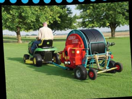
Move machine into position