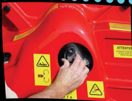
Adjust speed control for application rate