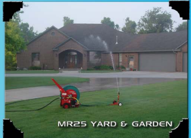
MR25 YARD & GARDEN