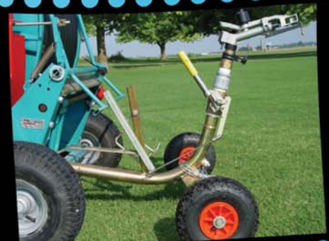
Traveler will automatically shut down at end of run