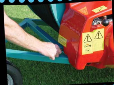
Pull anti reverse out and put gearbox in neutral to unroll hose