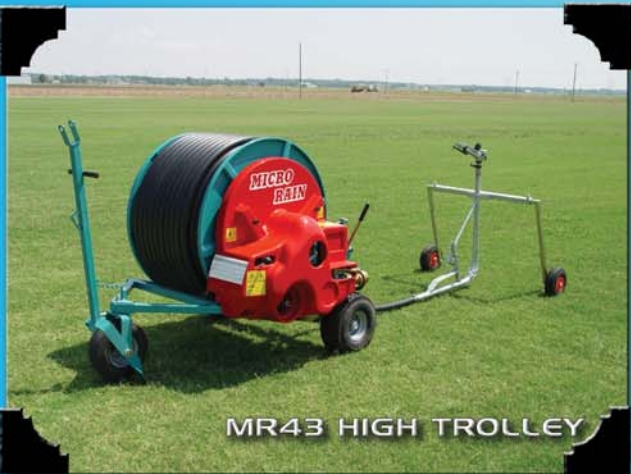
MR43 HIGH TROLLEY