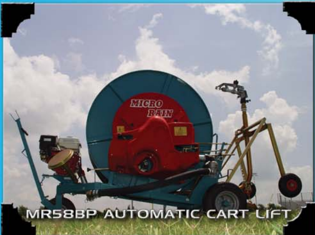
MR58BP AUTOMATIC CART LIFT