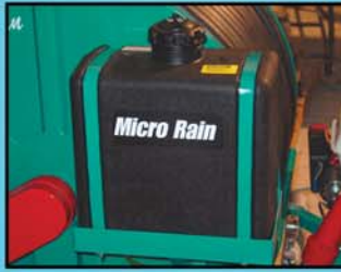
7 gallon non corrosive fuel tank with wide mouth opening for easy fill.