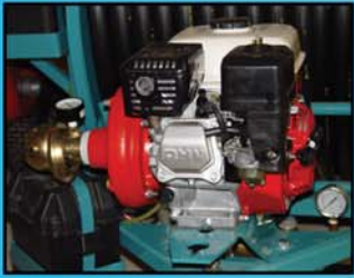
5HP or 9HP Honda Pull start standard (electric start optional)

Booster pumps can be utilized with any of our Micro Rain sprinklers. The reasons for adding booster pumps may be for increasing distance of sprinkler throw or increasing the gallons per minute of a machines capability. An example would be: Using a 5HP onboard booster to water a football field in one pass.