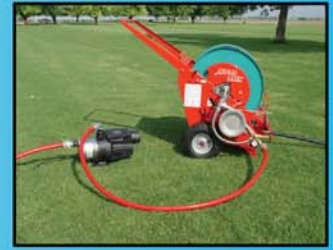
1HP portable electric booster pump for MR 25 and MR 32

*Consult with your MICRO RAIN dealer for the proper selection and applications of booster pumps. On average a booster pump will add from 30 to 60 PSI to the traveler.