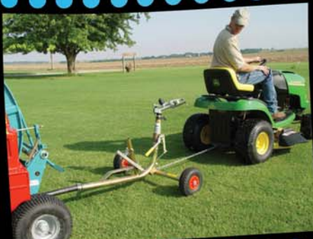
Pull sprinkler cart out

When you purchase a new MICRO RAIN for all of the advantages, which are presented in this brochure, remember one thing. While it is of little value other than on trade-in, we take pride that the MICRO RAIN even looks good after you purchase it. We simply call it "Pride in Ownership"