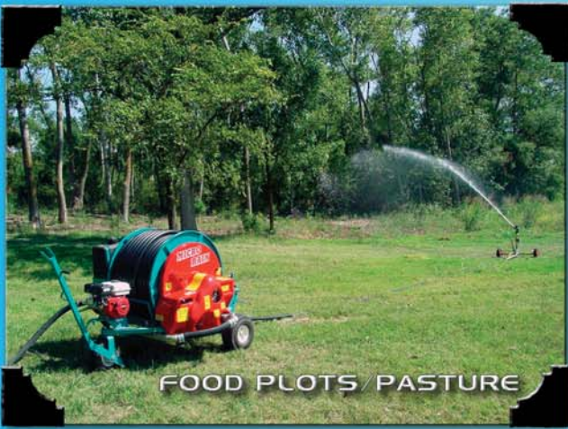
FOOD PLOTS PASTURE