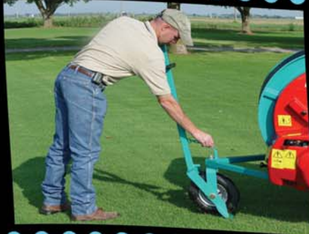
Raise hitch to anchor machine